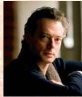
Mark Padmore Tenor and Trustee, St Endellion Festivals Trust

“I first came to St Endellion in 1983, a year after I had finished at university. The essentials were the same then as now – great music in an inspirational setting performed with lashings of enthusiasm. If I ever need inspiration I know where to come – to the beautiful church and soul-enriching Festival of St Endellion.”