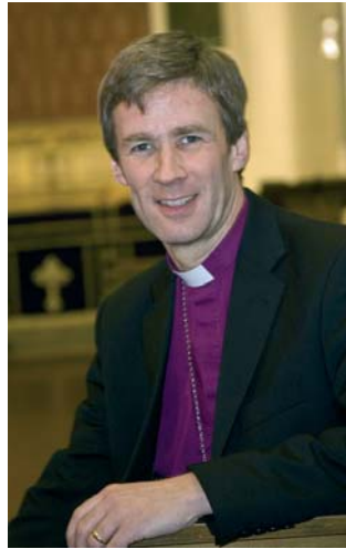
The Right Revd. Tim Thornton Bishop of Truro

“Living in an age of superficiality and instant gratification means that places of real beauty, space and reflection are even more important than ever.