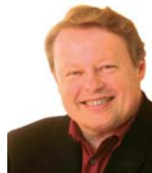
The late Richard Hickox, CBE Music Director, St Endellion Festivals between 1973 and 2008 and Music Director of Opera Australia

I am very pleased therefore to commend the plans, creativity and imagination of all those involved with this scheme. I hope and pray that it will be possible to bring to fruition a centre for spiritual and artistic endeavour and build resources which will bring people together to make beautiful music, paint and create thoughtful art and space for people to take a step aside and pray, talk and be together. St Endellion is a special place within a special county and the plans here will attract people from far and wide to come and enjoy the beauty of the countryside, explore the important church and be together with others who want to spend time reflecting and being quiet.”